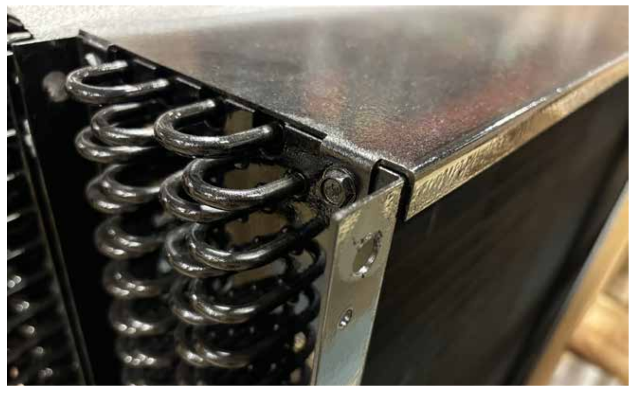
Custom loop thermosyphon hardware.