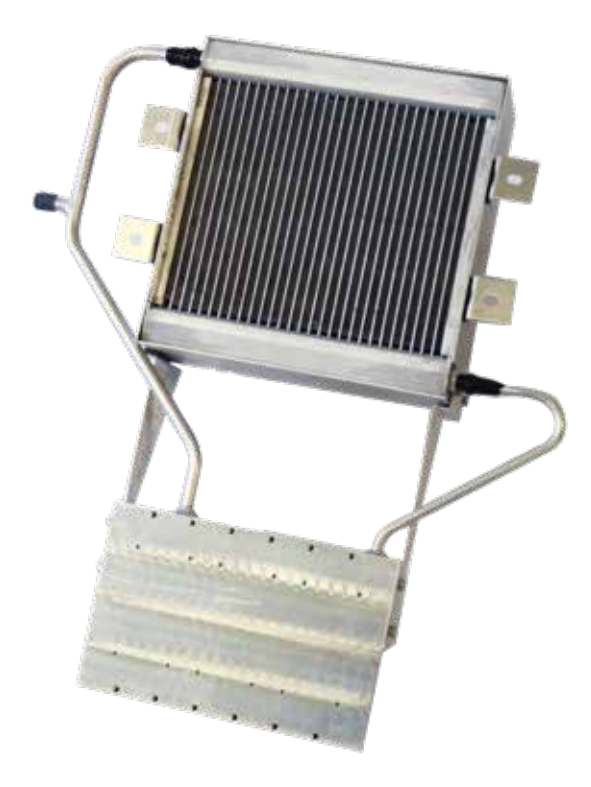
E-Coated Condenser Coil.

source to a heat sink. Its operation is based on the principle of gravity-driven fluid flow within a closed loop containing a working fluid, typically a refrigerant.