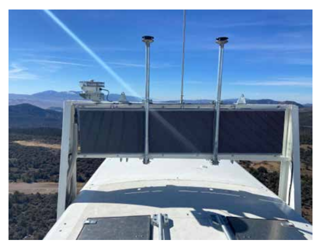
Condenser coil on the nacelle of a wind turbine for a loop thermosyphon.

1. Increased power density and reliability: Switching to the two-phase evaporative approach removes safety and maintenance issues linked with water cooling while boosting sys-