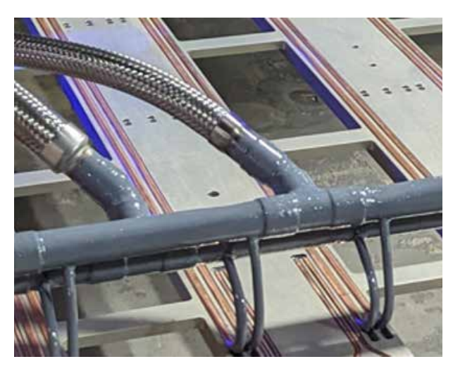
Heresite™ coated copper tubing and stainless over-braid flex lines.

and the heat sink. This continuous circulation of the working fluid facilitates efficient heat transfer without the need for external pumps or mechanical components, making loop thermosyphons a reliable and energy-efficient cooling solution.